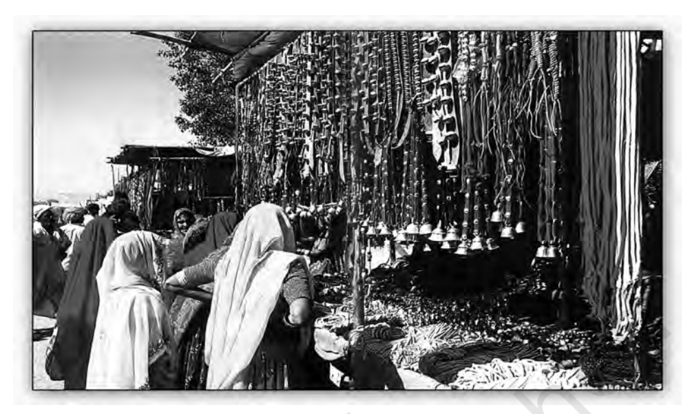
A weekly market in tribal area

under the control of the colonial state, they were gradually incorporated into the wider regional and national economies. Tribal areas were 'opened up' by building roads and 'pacifying' the local people (many of whom resisted colonial rule through their so-called 'tribal rebellions'), so that the rich forest and mineral resources of these areas could be exploited. This led to the influx of traders, moneylenders, and other non-tribal people from the plains into these areas. The local tribal economy was transformed as forest produce was sold to outsiders, and money and new kinds of goods entered the system. Tribals were also recruited as labourers to work on plantations and mines that were established under colonialism. A 'market' for tribal labour developed during the colonial period. Due to all these changes, local tribal economies became linked into wider markets, usually with very negative consequences for local people. For example, the entry of traders and moneylenders from outside the local area led to the impoverishment of adivasis, many of whom lost their land to outsiders.