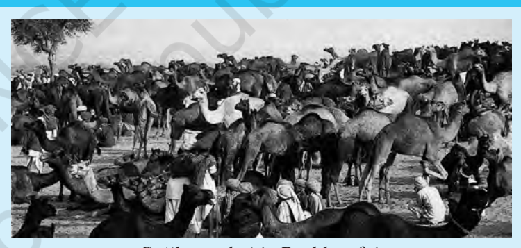
Cattle market in Pushkar fair

Read the passages in Box 4.3, which are taken from a guide book meant for foreign tourists. The passage illustrates the way in which a market – in this case the traditional annual cattle market and fair at Pushkar – can itself become a kind of product for sale in another market, in this case the market for tourism. (Look up any unfamiliar words in